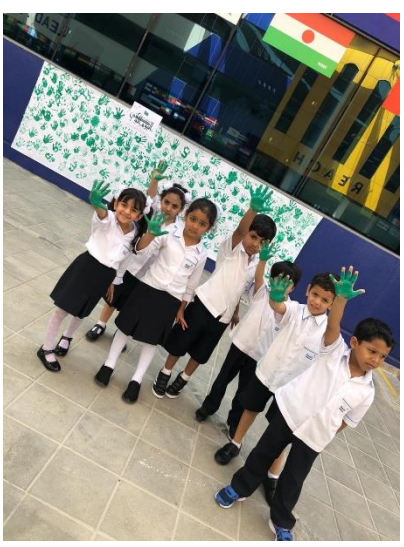
Lead. Learn. Inspire.